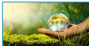
Environmental, Social and Governance (ESG) Investing