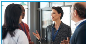
How to speak and be heard in meetings

The CISI member-exclusive magazine The Review has a catalogue of thought-provoking articles, these are two recently published ones: