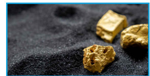
Can gold and gold mining be sustainable?